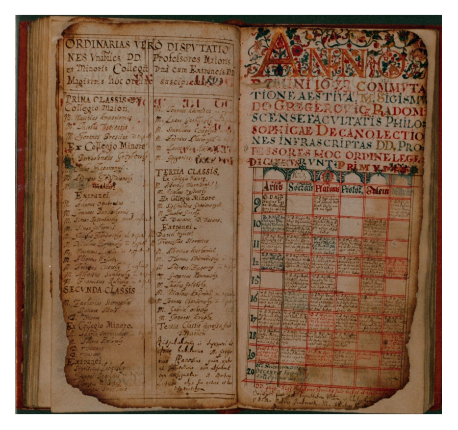
Photography 10. Pages of Liber diligentiarum. Jagiellonian Library, MS 220.