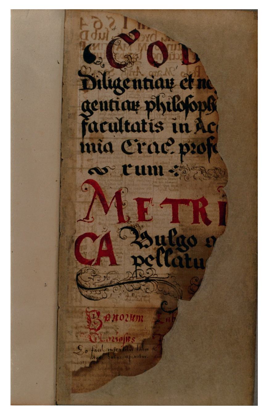
Photography 1. The title page of Liber diligentiarum. Jagiellonian Library, MS 220.