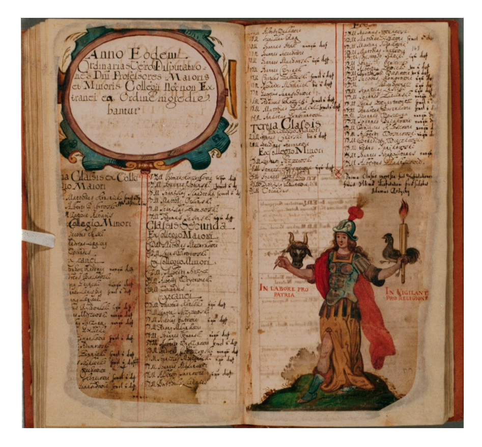
Photography 4. Pages of Liber diligentiarum. Jagiellonian Library, MS 220.