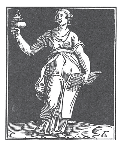
Fig. 2. C. Ripa – Wisdom.

The goddess is shown on a top of an incline (a hill or a mountain), thus reducing the landscape to minimum, essentially removing it. Landscapes were not an important part of the ideological program accompanying the creation of this illustration. Minerva stands on something resembling a green, scantily "clad" island. She seems detached from the world around her. This is an important message for the reader and we shall come back to it later. Two aspects seem to attract the reader's attention the most in the depiction of the goddess. The first one is the color sensitivity of the allegory's author, who used a relatively rich palette to decorate the robes and armor. The second one is a primitive, in fact, rendering of the proportions of the body, evident in its masculinization. Minerva was treated too literally as the patron of weaponry, which led to her losing her subtle femininity. Thus, her depiction is far from the Antique ideal, characterized by lightness and agility. Instead, she resembles a Roman legionary in female clothing, although on the other hand the aesthetics of Baroque valued full-rounded bodies, Peter P. Rubens being an excellent example.