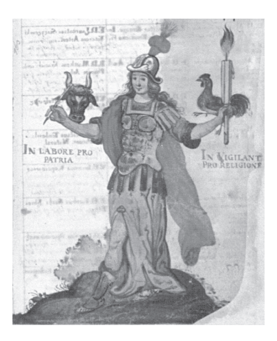
Fig. 1. The allegory of wisdom ( Codex diligentiarum ).