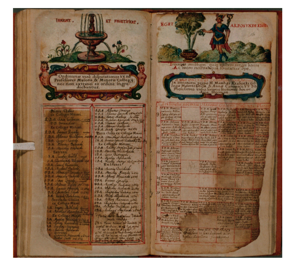
Photography 5. Pages of Liber diligentiarum. Jagiellonian Library, MS 220.