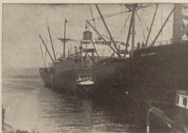
S. S. North Haven