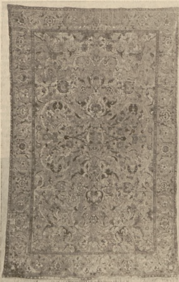
Rug from St. John's Church, Studziana