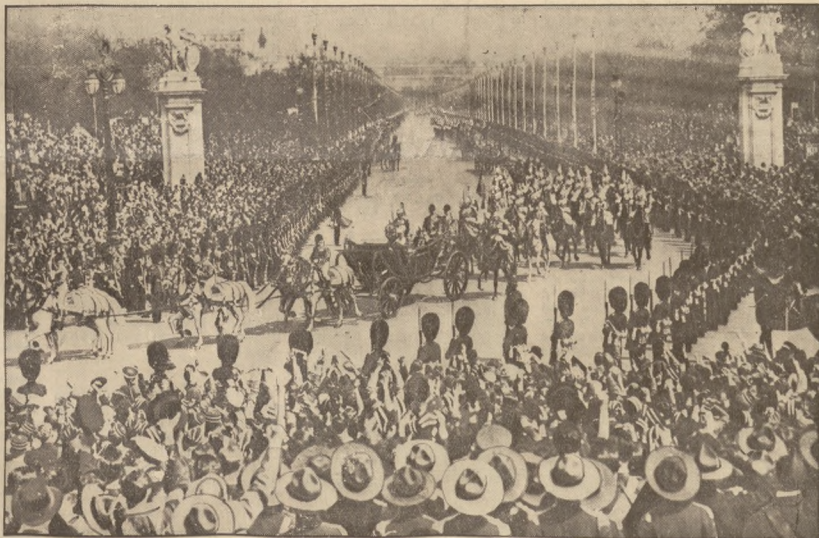
RETURNING FROM ST. PAUL'S TO BUCKINGHAM PALACE

spectacular. The King of England is no demagogue, dictator or showman. He is simply the faithful servant and sovereign of the people, and the hardest worked man in the country. They know this. They know him. Strange how well they feel they know him.