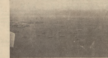
BRITISH FLEET IN THE BAY OF ADEN

President of the Republic: Expenditures — Zł. 2,718,930.