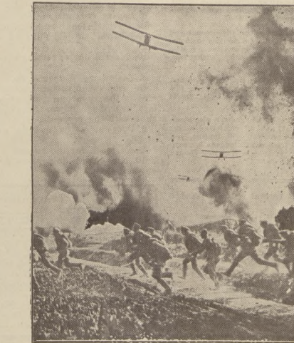
A German regiment advances across No Man's Land. Many thrilling scenes of battle, hitherto unseen by the public, are revealed in the Fox Film production, "The First World War." Edited by Laurence Stallings, the picture presents secret films from the Nations' archives — authentic, official, uncensored.

STAMP HOUSE A. Pachowski JASNA 16. TEL. 657-68 Stamps from every country for collectors. Catalogues & albums, collections of Polish stamps, also coins for Numismatists.